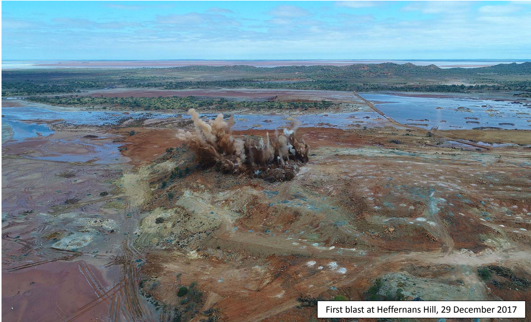
First blast at Heffernans Hill, 29 December 2017