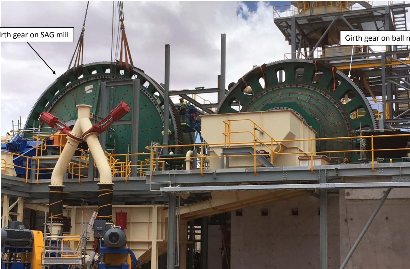
Girth gear on ball mill installed