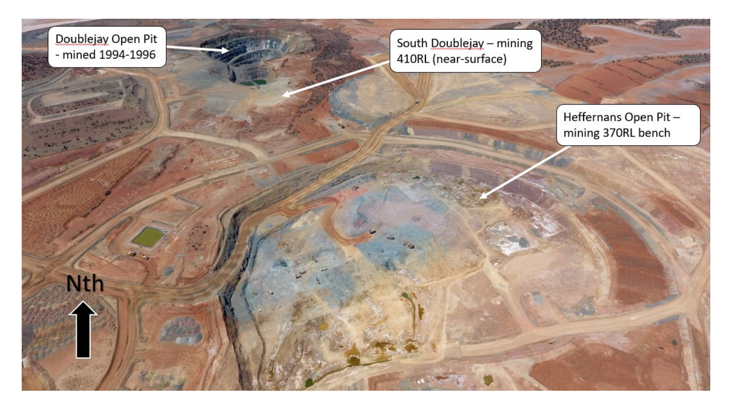
Figure 2: Aerial photograph of current mining activities at Jupiter showing Heffernans mining on the 370RL bench and South Doublejay commencing mining operations at the 410RL. Ganymede has also commenced mining south of the Heffernans open pit.